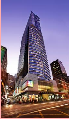
MAN YEE BUILDING